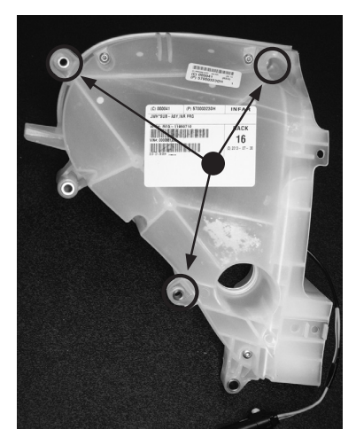
Figure 1.2 - Back view of brake side cabinet

3. Installing the New Speaker: With the cabinet removed from the bike, undo the 4 screws that hold the factory speaker to the cabinet. Carefully take off each speaker wire by disconnecting one at a time. Take the KENWOOD speaker and attach the factory speaker wires, noting they will only go on one way. Using the factory screws, attach the KENWOOD speaker to the cabinet. The factory speaker grille can be left in or replaced with the supplied metal mesh grille using the 3 factory screws on the inside of the fairing. In the KENWOOD grille, you will see two holes and one "keyhole" where the screws go through and into the fairing. The keyhole in the KENWOOD grille needs to be oriented so it is closest to the radio on each side for proper fitment. Using the factory grilles will cause a slight reduction in high-frequency volume. With the grilles in place and the speaker properly attached to the speaker cabinet, the cabinet can be re-installed.